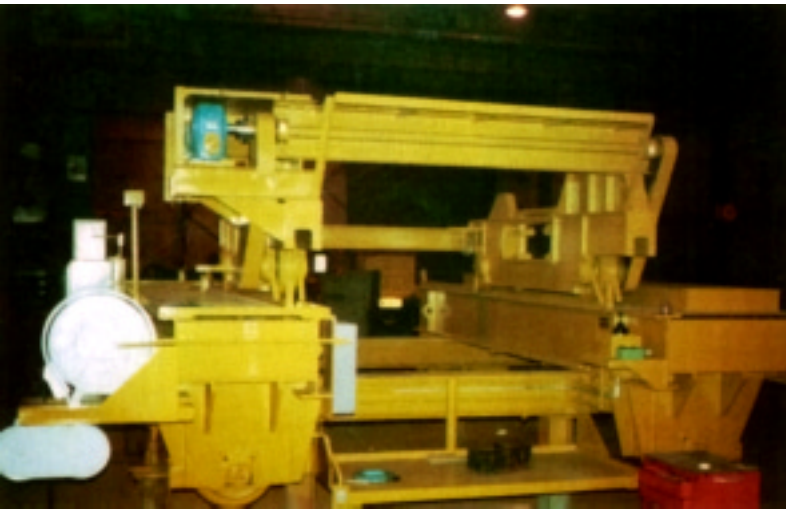
85 Ton capacity, bottom tapping ladle ingot pouring transfer car with transversing carriage arrangement