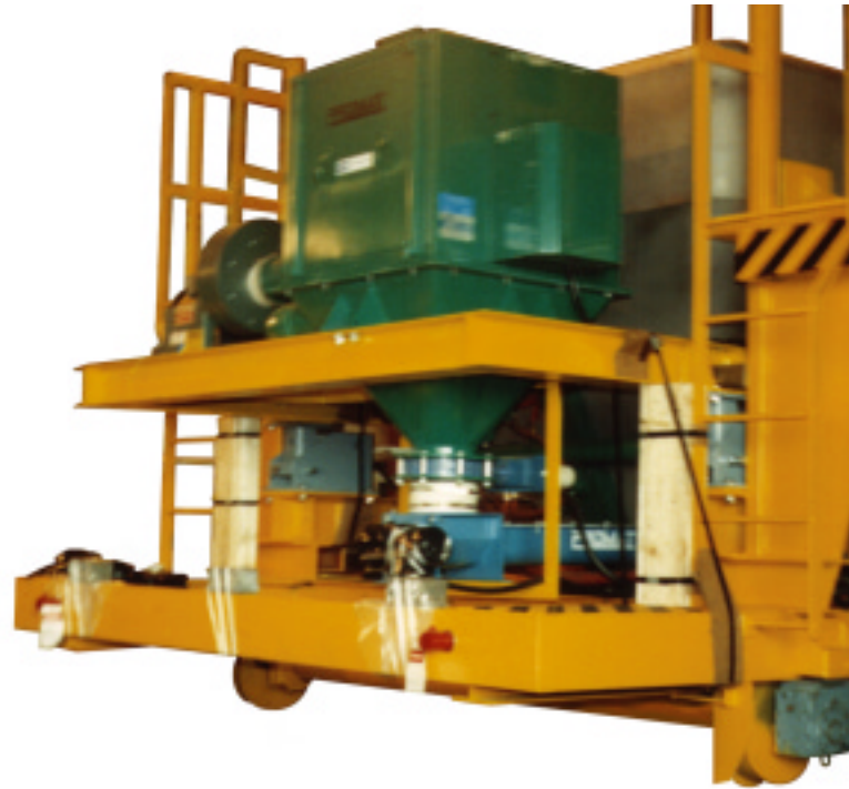
Custom built "weigh scale transfer car" for the completely automated mixing and delivery of steel mill fluxing and molding powers – ready for shipment