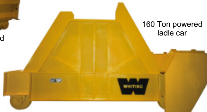
160 Ton powered ladle car