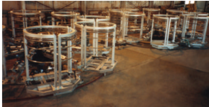
Carousel type, cooling mold handling system for fused oxides, fully automated control