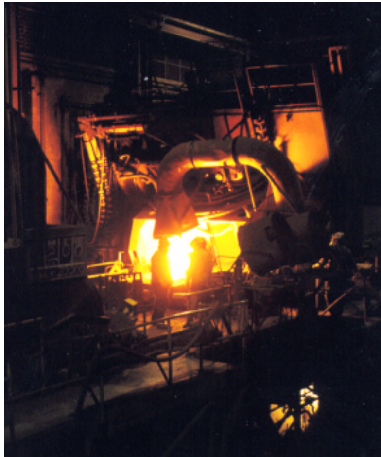
15 Ton foundry furnace