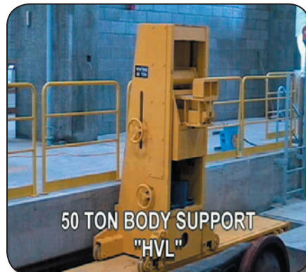
50 TON BODY SUPPORT "HVL"