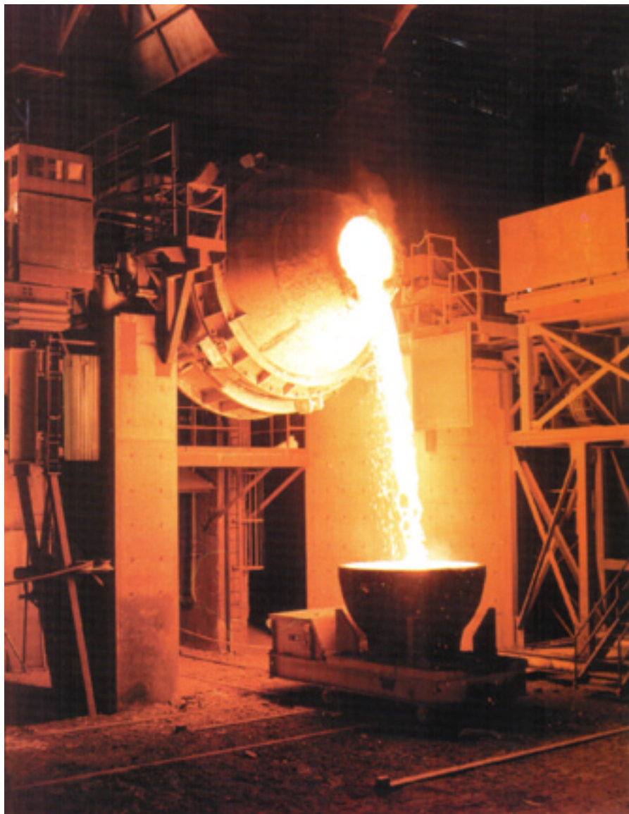
Figure 5: AOD tapping slag

A new 50-ton capacity Whiting slag pot transfer car was supplied to receive and remove the slag generated by the process without the use of the existing melts shop cranes.