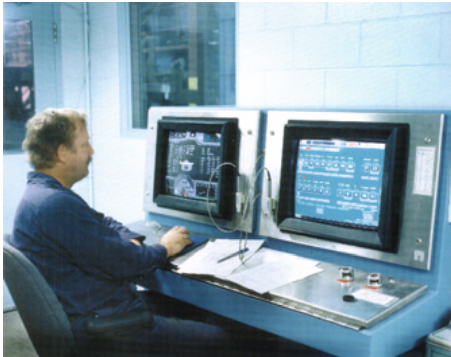
Figure 7: Control console using "touch screen" technology

Contact a Whiting Sales Engineer to find out more about our AOD equipment.