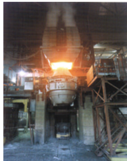
Figure 4: AOD blowing a heat

The tilt drive system is - helical gear, dual-input, single-output, double-quadruple reduction parallel shaft gear drive, connected through a gear coupling and driven by two (2) 52.5 hp dc mill motors. In addition, two (2) nitrogen motors were installed as a backup in case of power failure.