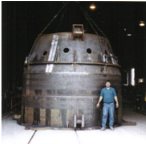
Figure 1: AOD vessel bottom section under construction in Whiting's Welland fabrication shop