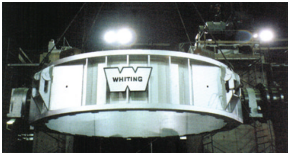
Figure 2: Trunnion ring being lifted into position