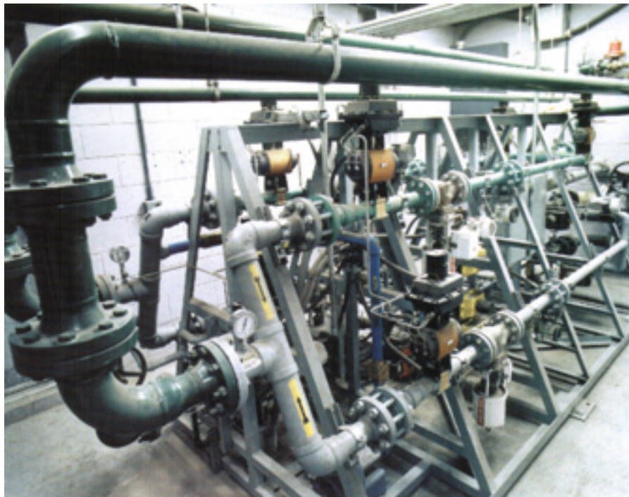
Figure 6: AOD valve rack